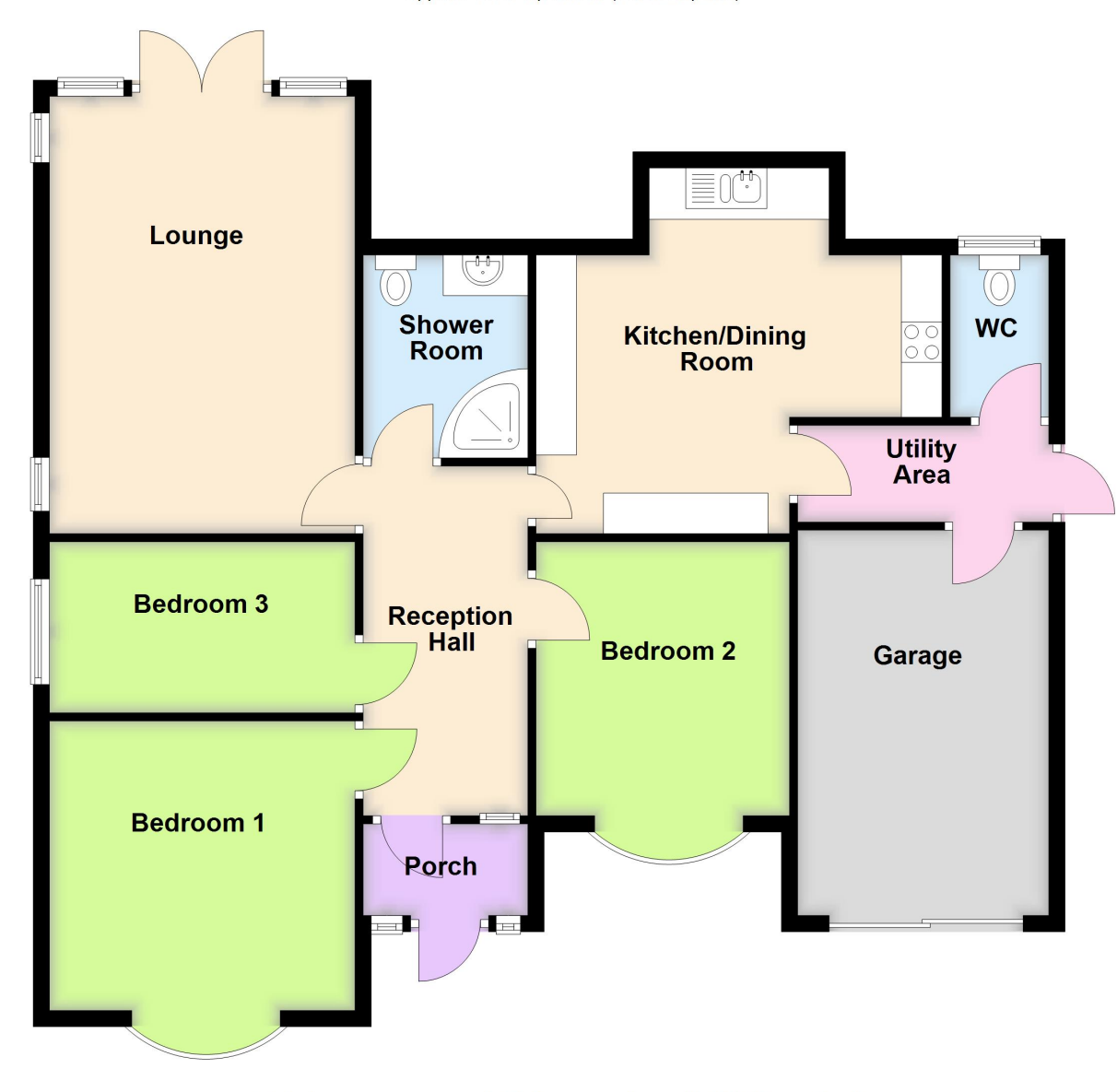
Ground Floor Approx. 111.0 sq. metres (1195.2 sq. feet)